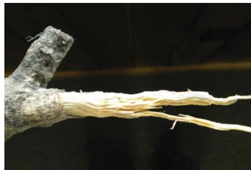
Figure 5. Stringy root decay.