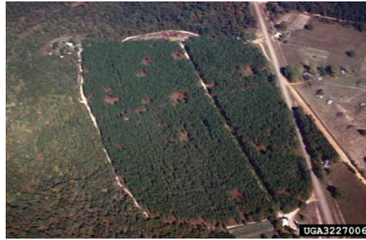
Figure 2. Pockets of dead trees.

conks (Figure 6) at the base of living and dead trees or stumps. These conks are hard to see because they are frequently formed below the litter layer around the tree or stump base, and are most prevalent during the cool wet winter months.