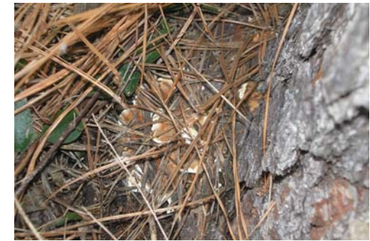
Figure 6. Conk at base of tree.