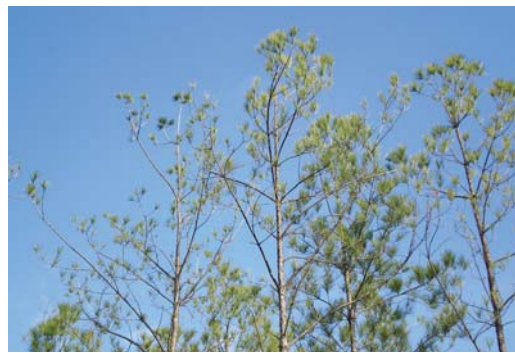
Figure 3. Thinning and yellowing of crowns.