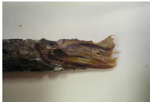
Figure 4. Pitch soaked root.