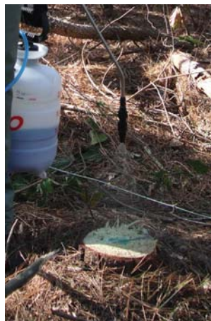
Figure 8. Stump treatment spray.

the cut stump using a spray applicator (Figure 8). Water-soluble borate powder, such as Cellu-Treat® (disodium octaborate tetrahydrate), has also proven to be successful in thinning operations in pine plantations with a high risk of Heterobasidion root disease. Apply this solution to the stump surface with a spray applicator, to the point of runoff. Sporangin®, and Cellu-Treat® need to be applied within twenty-four hours of harvest.