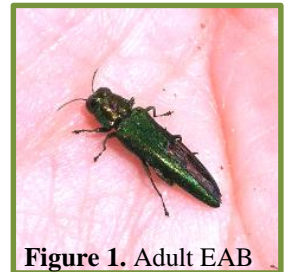
Figure 1. Adult EAB

BACKGROUND. The emerald ash borer, Agrilus planipennis , is a non-native invasive insect that was first found in the U.S. near Detroit, MI in 2002. Through both natural dispersal and human-assisted movement in infested materials such as firewood, this beetle has now spread to many additional states. It was first found in North Carolina in 2013. The emerald ash borer has already killed tens of millions of ash trees in the U.S. and has the potential to eliminate the species from the landscape.