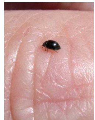
Pseudoscymnus on a researcher's finger.

dormant young adelgids during the summer. Releases of PT are focused on hemlocks along the leading edge of HWA infestation. 176,387 beetles have been released at 50 sites in 23 counties. DCNR staff uses a plastic bat to beat branches over a white sheet to see if PT has established at sites in the years following release. This lady beetle should not be viewed as a cure-all, since its effectiveness is still in the testing stages. However, the data show some encouraging signs so far. To date, we have recovered 642 beetles. Adult recovery indicates overwintering success, and larval recovery indicates successful field reproduction.