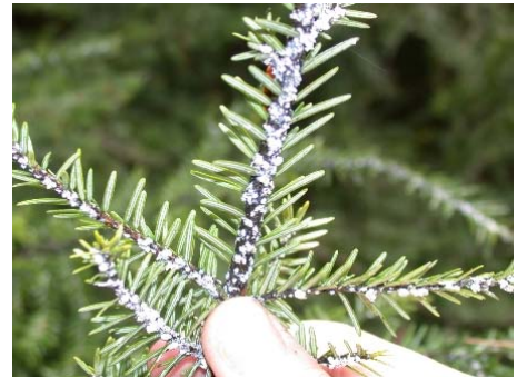
Look for hemlock woolly adelgid on the undersides of lower branches

Hemlock woolly adelgid was introduced from Asia into the Pacific Northwest in 1924. It was probably introduced into the northeastern US in the 1950's, and it was first discovered in Pennsylvania in 1967. This insect has been damaging hemlock ever since, and it is spreading. To date, 49 counties in the eastern two-thirds of PA have been infested with this insect.