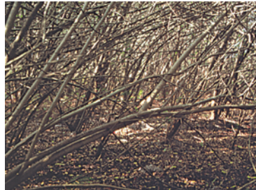
Left: Understory of Brazilian pepper forest, illustrating the lack of native vegetation.

Brazilian pepper is related to poisonwood, poison oak and poison ivy. This shrub-like tree produces dense clusters of small berries that change from green to bright red as they ripen. Local dispersal of this species is primarily by raccoons and opossums; long-distance spread is facilitated by fruit-eating birds, such as migratory American robins. Brazilian pepper berries have been reported to produce a narcotic or toxic effect on native birds and wildlife during some parts of the year.