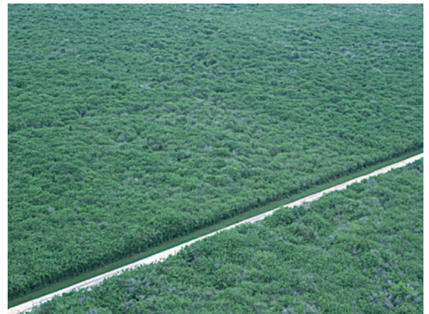
Right: Monospecific stand of Brazilian pepper in Everglades National Park.