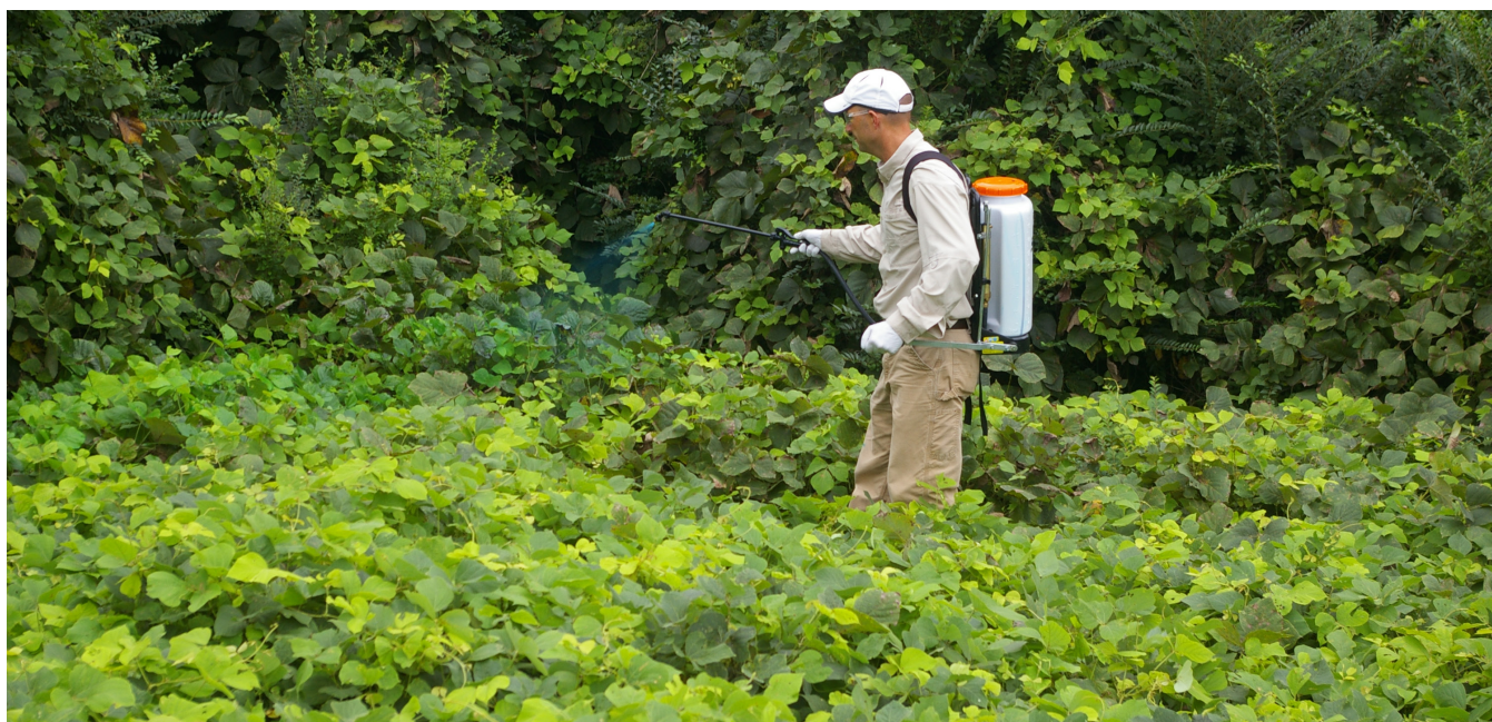
Spraying kudzu with a backpack sprayer is an effective application method in residential areas.

Kudzu bugs feed voraciously on new kudzu growth by sucking out the sap like aphids. You will not see foliar damage as they do not chew holes in the leaves. Kudzu bugs may reduce kudzu growth, but to date, we have not seen elimination of kudzu patches by the bugs. There is some evidence, however, that kudzu bugs may have enough impact to reduce the competitive ability of kudzu. This is apparent as other plants begin to grow through previously dense kudzu mats. The long-term fate of kudzu survival in the presence of kudzu bugs is still uncertain.