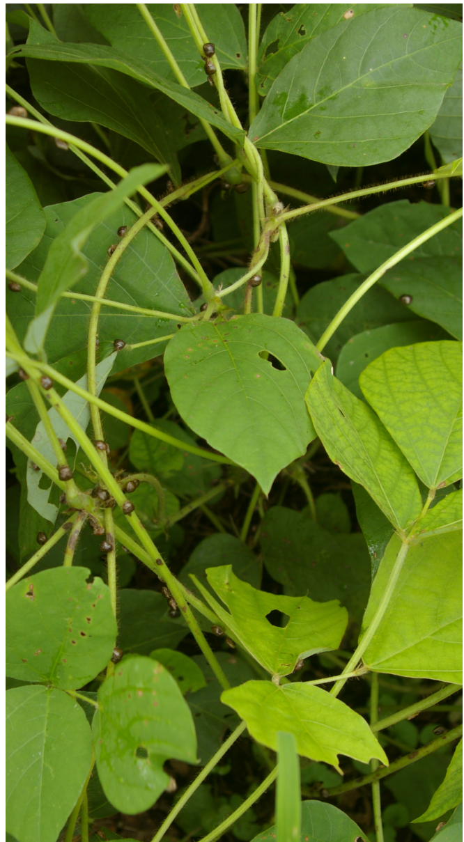
Kudzu bugs feeding on kudzu

Most construction projects that remove the topsoil will remove the kudzu root crowns. However, if the topsoil containing the root crowns is put back on the site, many will sprout and begin to reinfest the site. Aggressive kudzu treatment will be needed around the perimeter of the site where the soil is not disturbed. This can be initiated before or after construction.